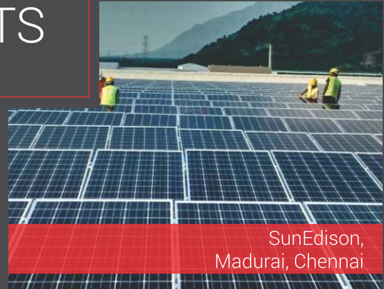
SunEdison, Madurai, Chennai