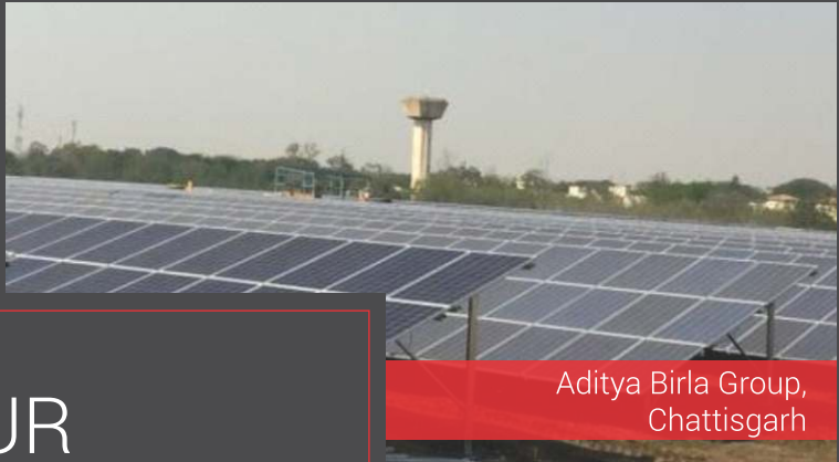
Aditya Birla Group, Chattisgarh