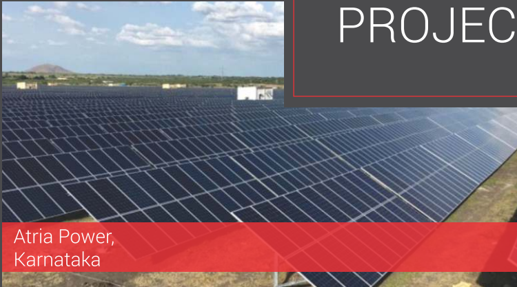
Atria Power, Karnataka