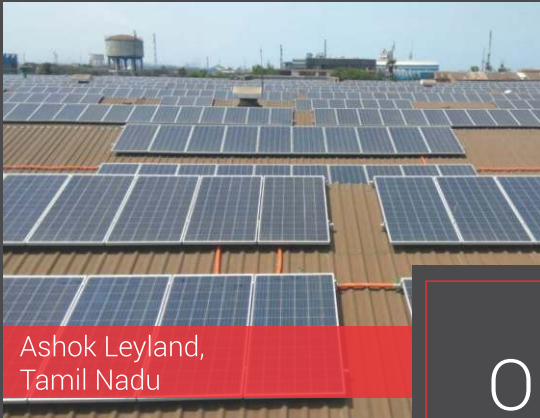
Ashok Leyland, Tamil Nadu